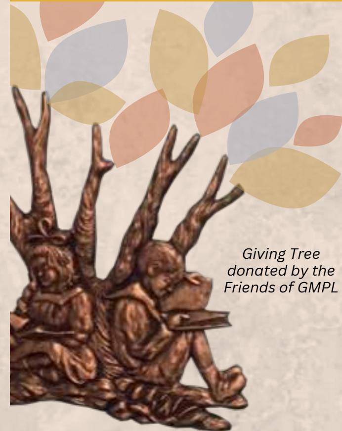
Giving Tree donated by the Friends of GMPL